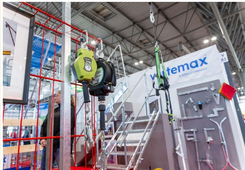
Alupercha/Alsipercha Anti-fall anchoring system