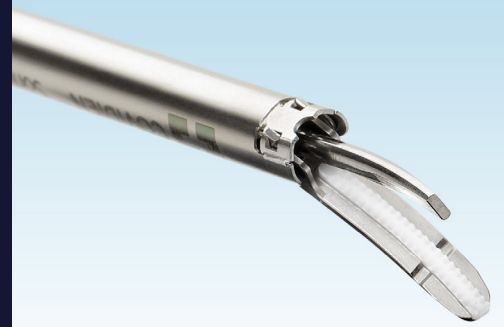
Sonicision™ Curved Jaw Cordless Ultrasonic Dissection System

The next-generation of cordless ultrasonic vessel sealing and dissection is here